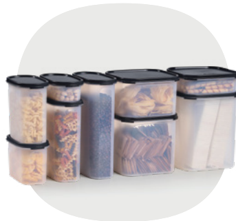
MODULAR MATES® OVAL & SQUARE SET

Pantry makeover for your healthy makeover! 9-pc. container set includes Ovals 1-5 and Squares 1-4 with seals.