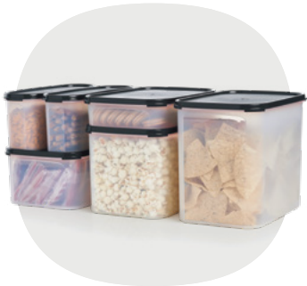
MODULAR MATES® 6-PC. SET

Keep healthy treats tasty to the last crunch. 6-pc. container set includes two Super Oval 2s plus one each Rectangular 1, 2, 3, and 4 with seals.