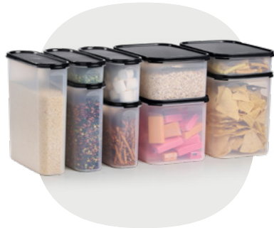
MODULAR MATES® SUPER OVAL & RECTANGULAR SET

Protect and preserve everything from your healthy trail mix to those cheat day favorites. 9-pc. container set includes Super Ovals 1-5 and Rectangulars 1-4 with seals.