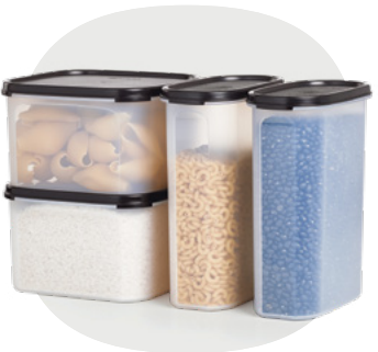
MODULAR MATES® 4-PC. SET

All shapes and sizes of pasta or beans. 4-pc. container set includes two each Ovals 4s and Square 2s with seals.