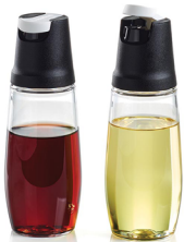
Tilt 'N Serve Dispensers † Features a self-opening cap and uniquely designed spout for dripless pouring. Perfect for oil, vinegar, or soy sauce. 11 oz./340 mL. Set of two. 403 $42

† Handwashing recommended. Dishwasher safe up to 150° F/65° C.