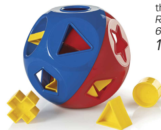
Shape-O® Toy A kid favorite for more than 50 years. 6 1/2"/17 cm. Recommended for ages 6 months and up. 1398 $36