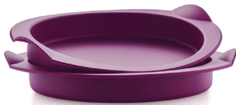
Silicone Small Round Forms 6 1/4"/16.2 cm diameter x 3/4"/2.4 cm. Set of two. 495 $39

Made with high-grade silicone, and safe for the microwave, fridge and freezer.