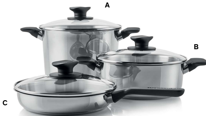
A. Tupperware® Daily Universal Cookware 7.4-Qt./7 L Stockpot with Glass Cover 921 $164