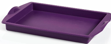
Silicone Rectangular Form 11.5 x 7.5 x 1"/29.8 x 19.4 x 2.6 cm. 486 $39

Made with high-grade silicone, and safe for the microwave, fridge and freezer.