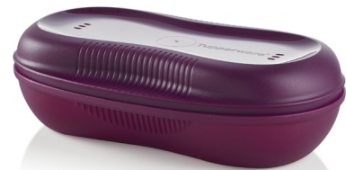
Microwave Breakfast Maker EXCLUSIVE! Makes omelets, oatmeal, and French toast. Includes 1¾-cup/430 mL Breakfast Maker.