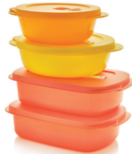
CrystalWave® PLUS 4-Pc. Set Includes 2½-cup/600 mL Round, 4¼-cup/1.1 L Round, and two 4-cup/1 L Rectangulars.