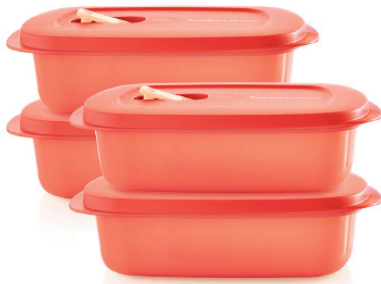
CrystalWave® PLUS Rectangular Set Includes four 4-cup/1 L Rectangulars.