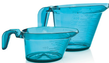
Micro Pitcher 2-Pc. Set Includes 1-cup/250 mL and 2-cup/500 mL pitchers.