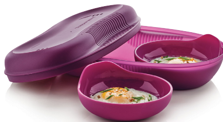
Microwave Breakfast Maker Set Makes omelets, oatmeal, and French toast. Includes 1¾-cup/430 mL Breakfast Maker plus two Inserts for poached eggs and egg patty.