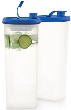
Slim Line Pitcher with Strainer Set Set of two 8-cup/2 L lightweight pitchers with liquid-tight seals and flip-top caps. Fits in fridge doors.