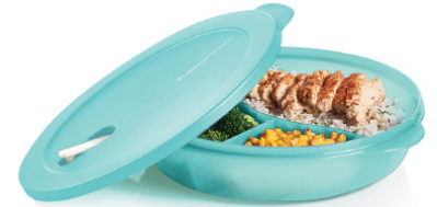
CrystalWave® PLUS Divided Dish Includes one 2-cup/500 mL compartment and two 1¼-cup/300 mL compartments.