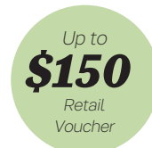
New Consultant Retail Credit