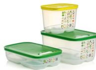
April First Order Reward