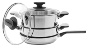
Confident Start Program

Check out some of the other programs and awards you can achieve!