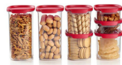
Party Perks Monthly Personal Sales Challenge

New Consultants are those that join in April by registering and purchasing a kit. The date of kit purchase determines the date you became a New Consultant. April sales month runs March 30–April 26, 2023. May sales month runs April 27–May 31, 2023. June Sales month runs June 1–28, 2023. Sales reflecting as (QV) Qualifying Volume count toward your qualification. New Consultants as of April 13 can track their progress toward qualifying in a new personal tracker report available online. Retail values are subject to change. All awards are subject to substitution. Your award will be available to redeem in July. To redeem your award, create a personal order and select the award from your special offers. A minimum of $1 retail is required to place the award order.